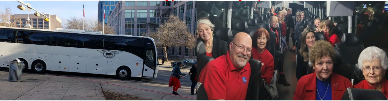
The bus is here and we are ready to go!