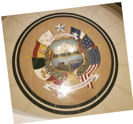
Remember the Alamo