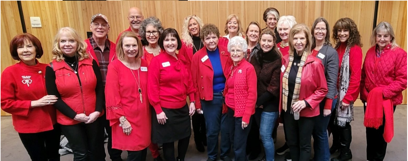
On our way home!