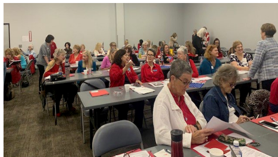
Galveston Republican Women Attending