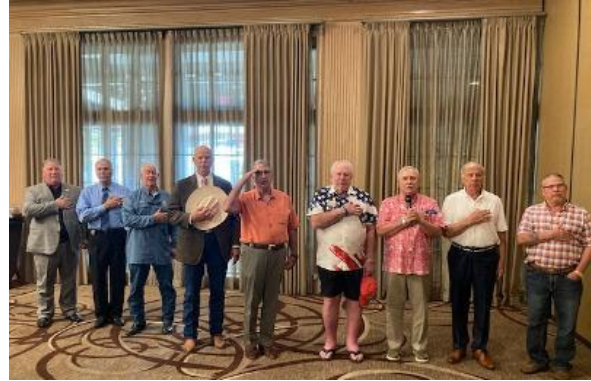
Former servicemen leading in the Pledge of Allegiance