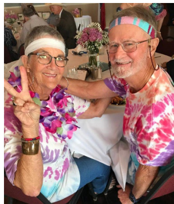
Can't forget the Rigsby's!!