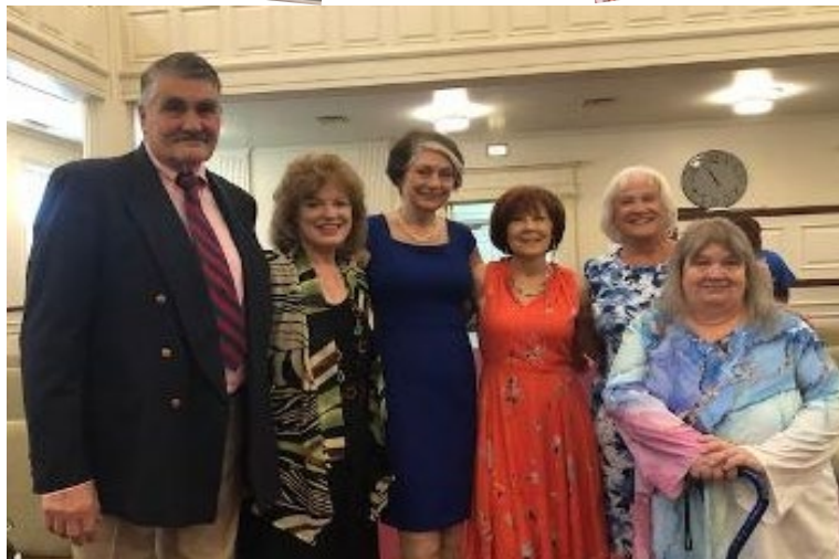
Galveston Republican Women