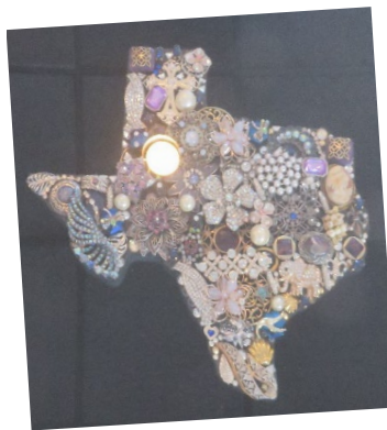
State of Texas Made of jewels