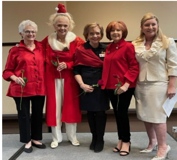
Swearing-in of 2024 GRW Officers