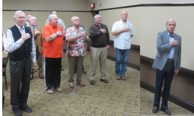
Military and first responders leading with the pledge