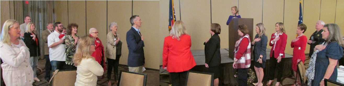
The Precinct Chairs and all candidates led us in the pledges.

San Luis Hotel – GRAND BALLROOM 5222 Seawall Blvd., Galveston