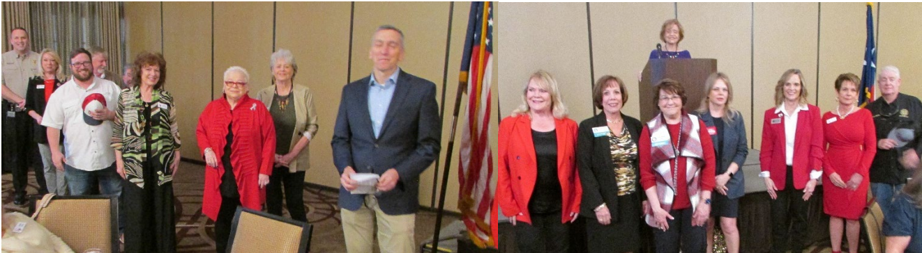
After the pledges they introduced themselves.